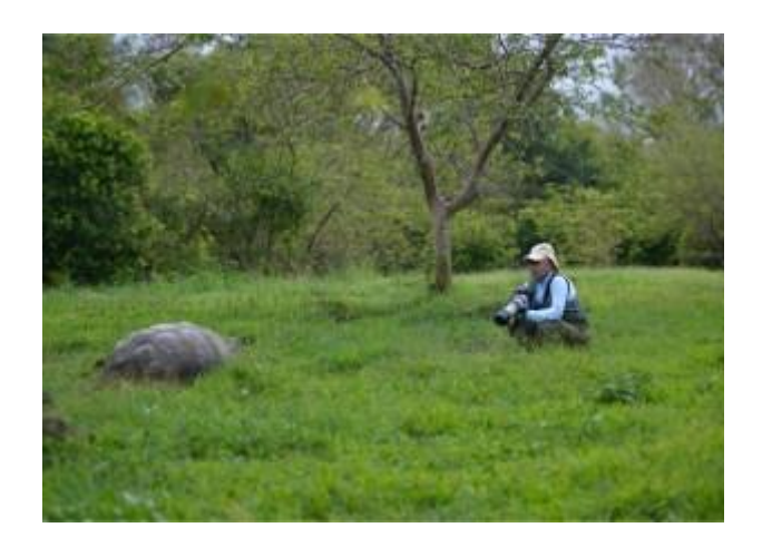
Level: 1 Dry landing and hiking